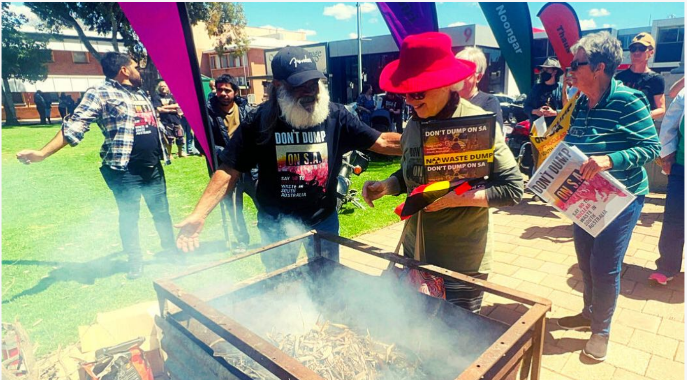
Smoking Ceremony at Port Augusta Rally, 15 October 2022.